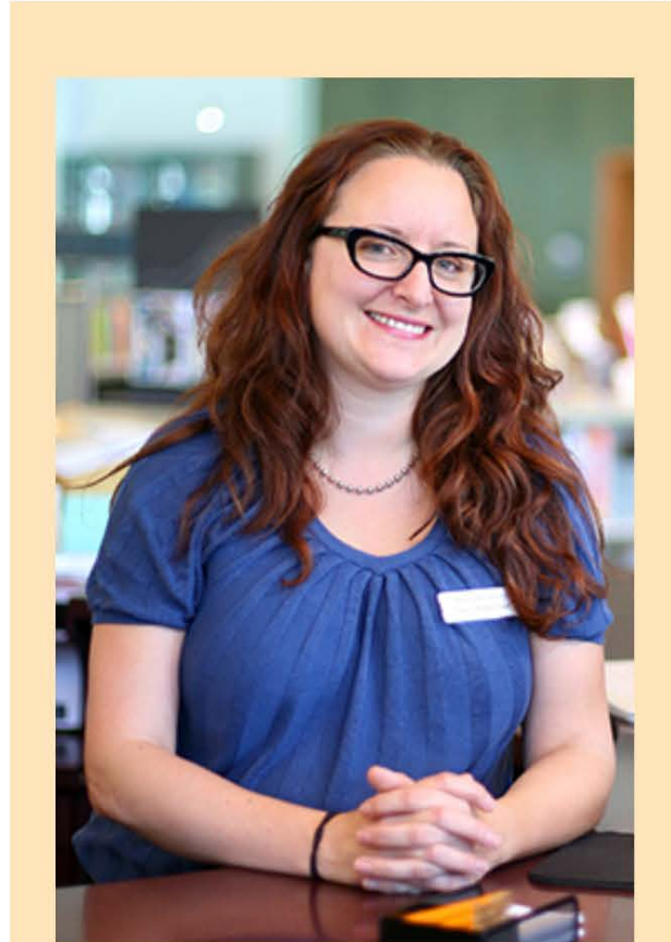
Sno-Isle librarians are eager to meet face-to-face with customers who

The Book-a-Librarian sessions are tailored to meet the specific needs of the individual. A library staff member will give undivided attention to customers who want in-depth technical assistance on topics such as starting an email account, browsing the library's catalog, downloading e-books and audiobooks, searching the Internet, using electronic databases