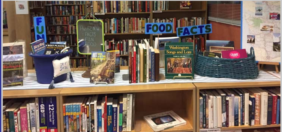
Ongoing's Railroad display (top) and the current Pacific Northwest sale happening now!